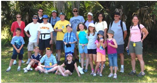
SEACOAST SCIENCE CENTER ECO-FAMILY ADVENTURERS 2010